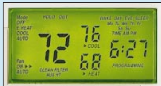
Large, Backlit LCD Display