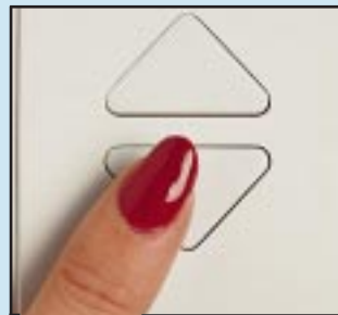
Soft Rubber Buttons