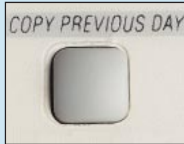
Copy Previous Day