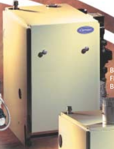
BW3 GAS- FIRED BOILER