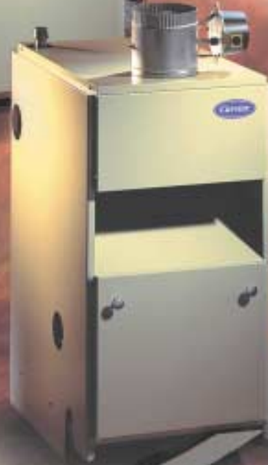
BS1/BS2 STEAM BOILER

ENJOY INDOOR WEATHER COMFORT WITH WATER OR STEAM HEATING