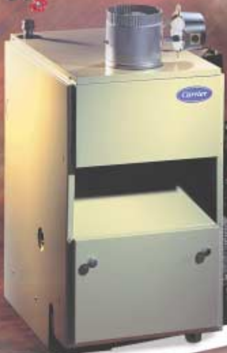
BW1/BW2 WATER BOILER